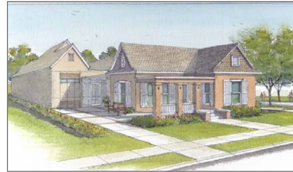
Rendering of East Room Renovation

The total project is expected to cost $32.1 M and will be financed using a combination of private (63%) and public (37%) dollars.